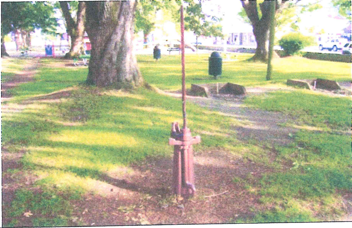
Picture # 5945 – Switch restored in August, 2022.