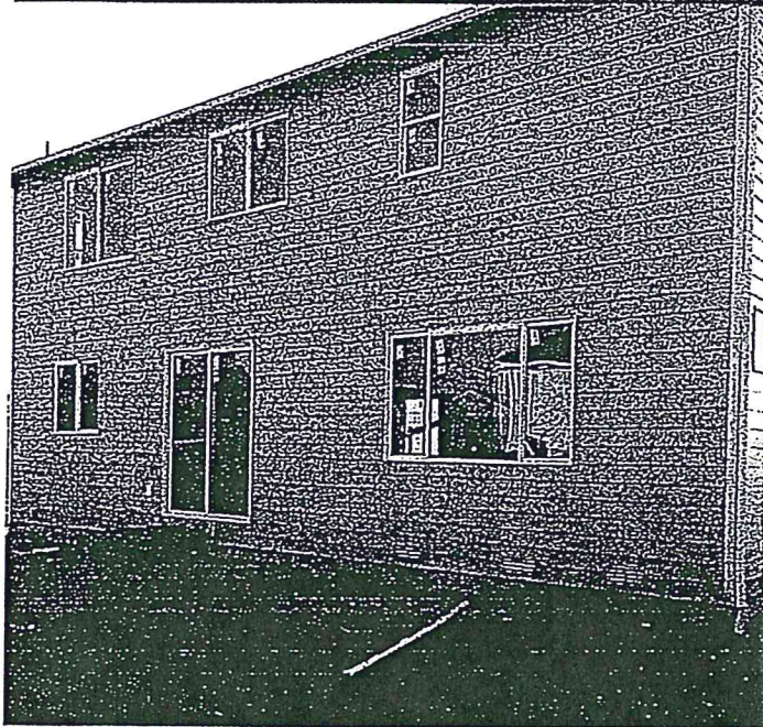
BACK OF HOUSE