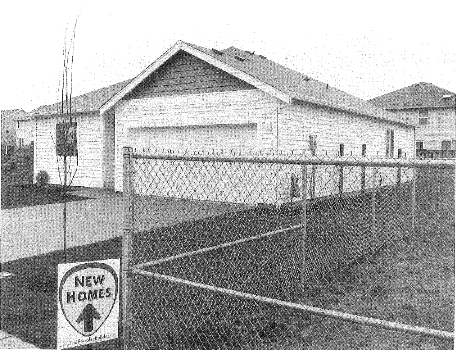
Front View. Date taken 03/15/2012

If using the Elevation Certificate to obtain NFIP flood insurance, affix at least two building photographs below according to the instructions for Item A6. Identify all photographs with: date taken; "Front View" and "Rear View"; and, if required, "Right Side View" and "Left Side View." If submitting more photographs than will fit on this page, use the Continuation Page on the reverse.