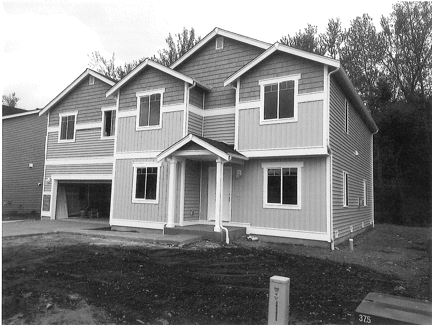
Front View 4/11/13

If using the Elevation Certificate to obtain NFIP flood insurance, affix at least 2 building photographs below according to the instructions for Item A6. Identify all photographs with date taken; "Front View" and "Rear View"; and, if required, "Right Side View" and "Left Side View." When applicable, photographs must show the foundation with representative examples of the flood openings or vents, as indicated in Section A8. If submitting more photographs than will fit on this page, use the Continuation Page.