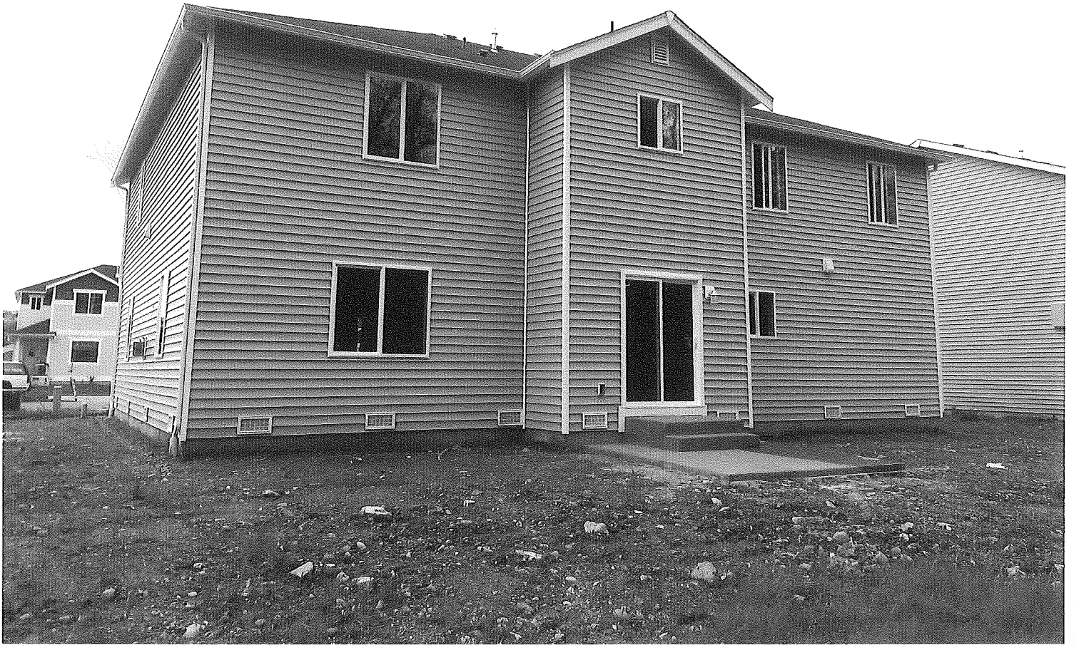
Rear View 4/11/13

If submitting more photographs than will fit on the preceding page, affix the additional photographs below. Identify all photographs with: date taken; "Front View" and "Rear View"; and, if required, "Right Side View" and "Left Side View." When applicable, photographs must show the foundation with representative examples of the flood openings or vents, as indicated in Section A8.