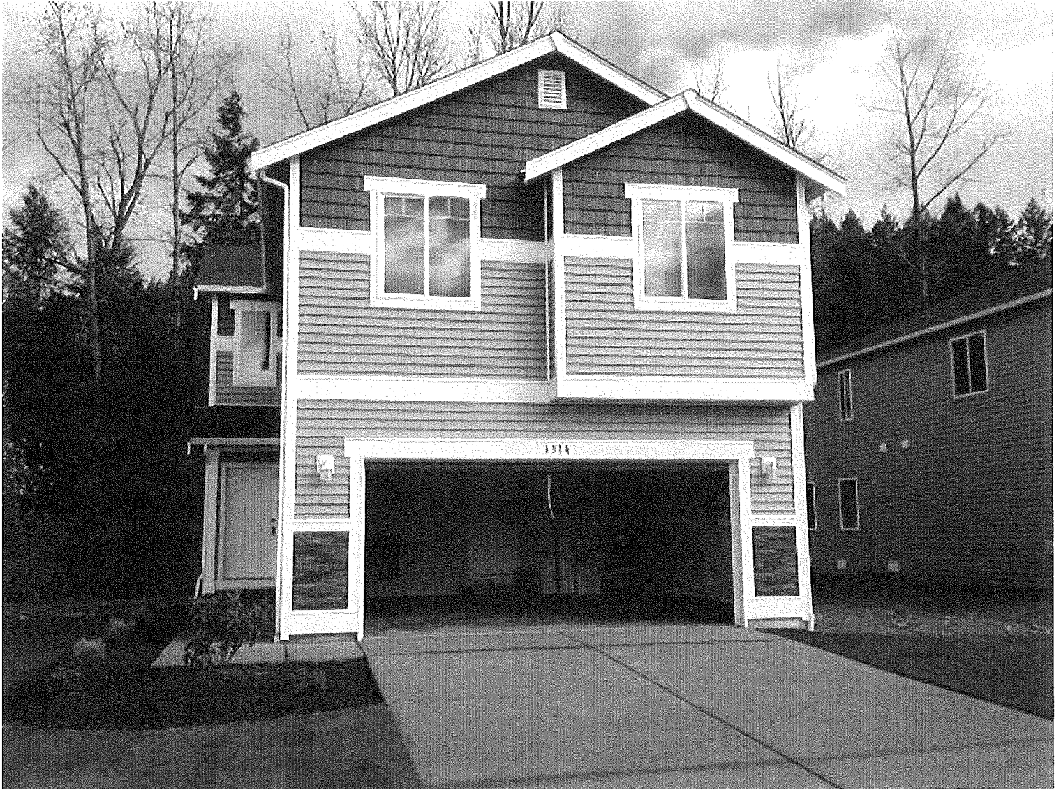
Front View. Date taken 11/29/2012

If using the Elevation Certificate to obtain NFIP flood insurance, affix at least two building photographs below according to the instructions for Item A6. Identify all photographs with: date taken; "Front View" and "Rear View"; and, if required, "Right Side View" and "Left Side View." If submitting more photographs than will fit on this page, use the Continuation Page on the reverse.